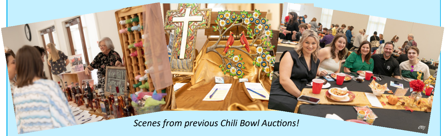
Scenes from previous Chili Bowl Auctions!

Our 11th Annual Chili Bowl Event is coming up September 21st, from noon - 4 in the Fellowship Hall! Please sign up to attend, help or bring items. Deadline for auction items is September 14th! No items will be accepted after this date because all items have to be cataloged and bid sheets printed. Thank you for understanding! This is a benefit event to allow us to keep providing funding to our adopted school in Haiti, as well as an outreach to local non-profits who may need help. Sign up on the rotunda at your convenience, or see the QR code on the poster that takes you to the online SignupGenius. Thank you for all your support! Your CTK Faith in Action Team!