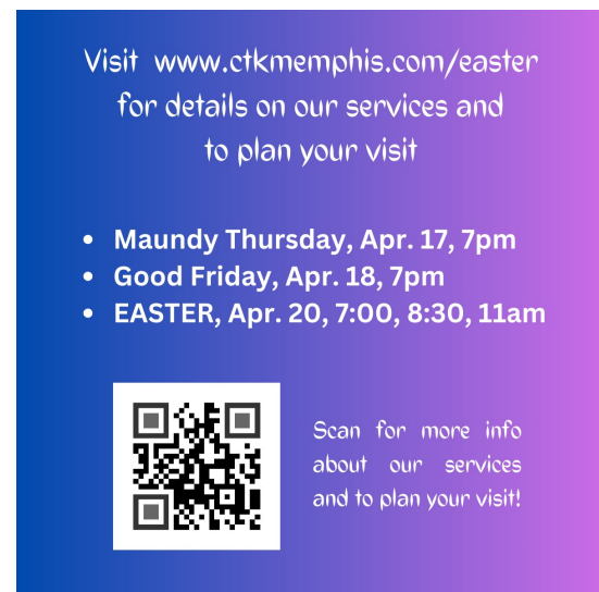
(back of card)

Help us get ready for Easter! If you are interested in sharing your gift of hospitality by joining the Connections Team , please email Genie at gswan@ctkmemphis.com . You can serve in one of two ways (or both!):